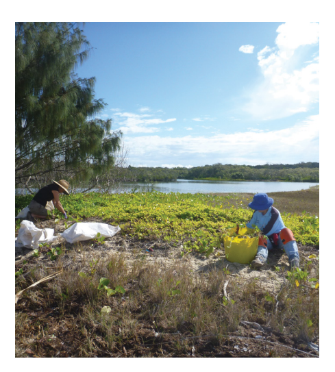
NICA value contribution

In FY2022, NICA estimates that our volunteers contributed over 5,000 hours toward our programs and the catchment – significantly multiplying every $1 invested in our programs through grants and other funds.